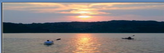
Miles of Rivers and Lake Shore